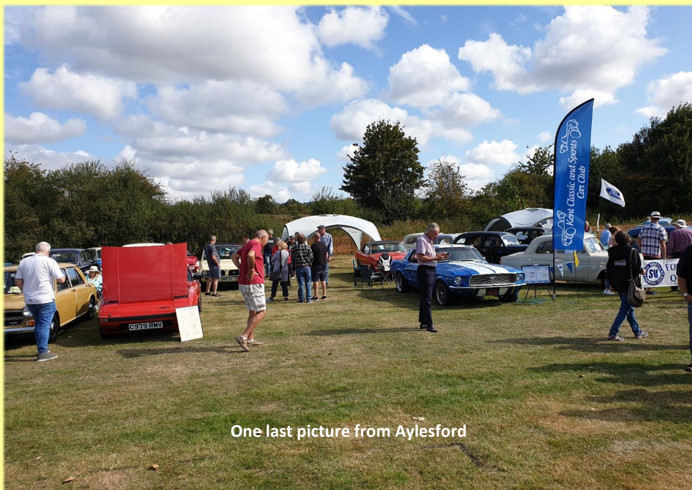
One last picture from Aylesford