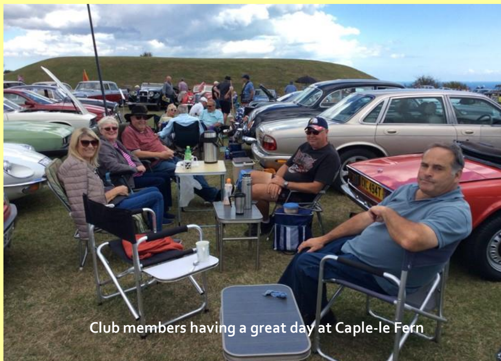
Club members having a great day at Caple-le Fern

at The Hastings Arms, Gillingham, ME7 2YD