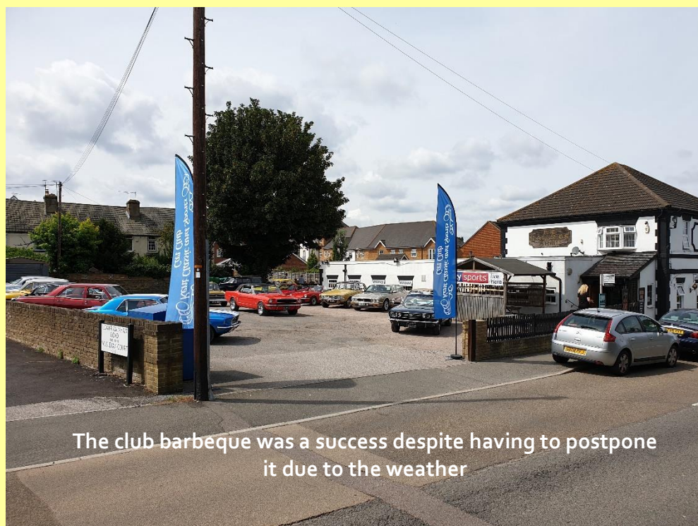
The club barbeque was a success despite having to postpone it due to the weather