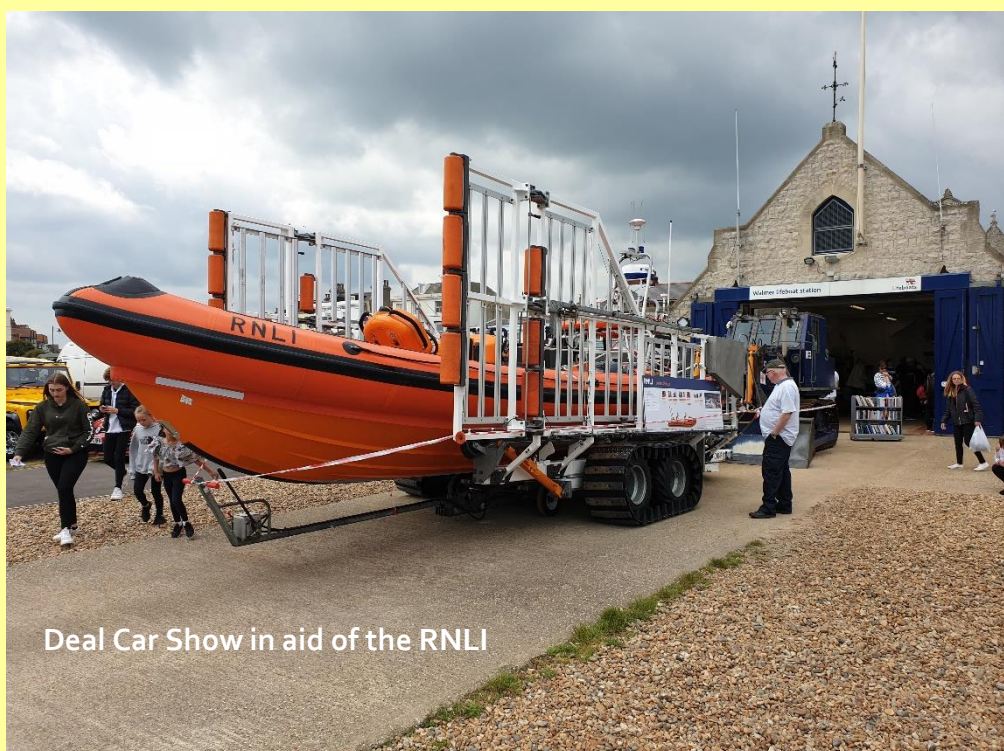
Deal Car Show in aid of the RNLI

Hi all here are a few pictures from UKP classic car show