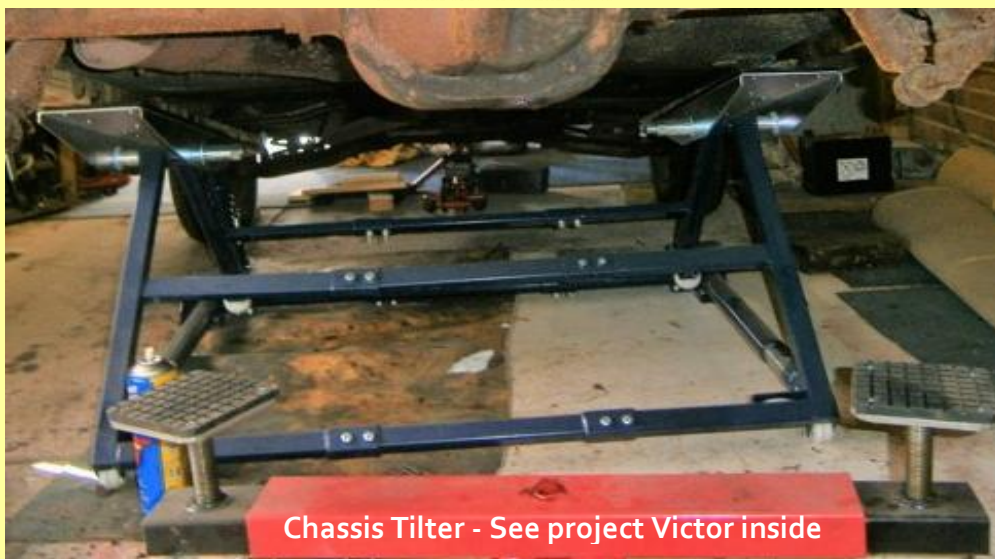
Chassis Tilter - See project Victor inside

Next Club Meeting: Tuesday 4 th September arrive around (7:30pm - 8:00pm) at The Hastings Arms, Gillingham, ME7 2YD